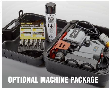
OPTIONAL MACHINE PACKAGE