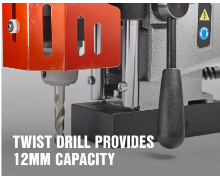
TWIST DRILL PROVIDES 12MM CAPACITY