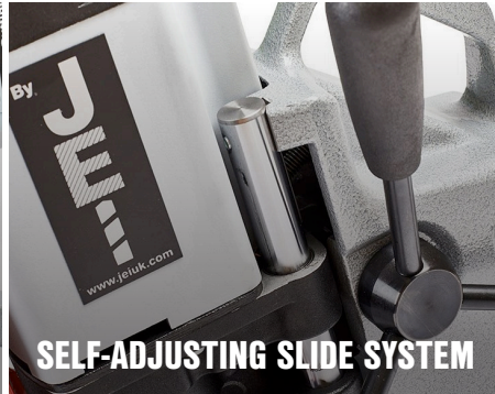
SELF-ADJUSTING SLIDE SYSTEM