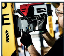
Suitable for drilling painted steel