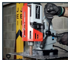
Suitable for drilling ultra thin steel